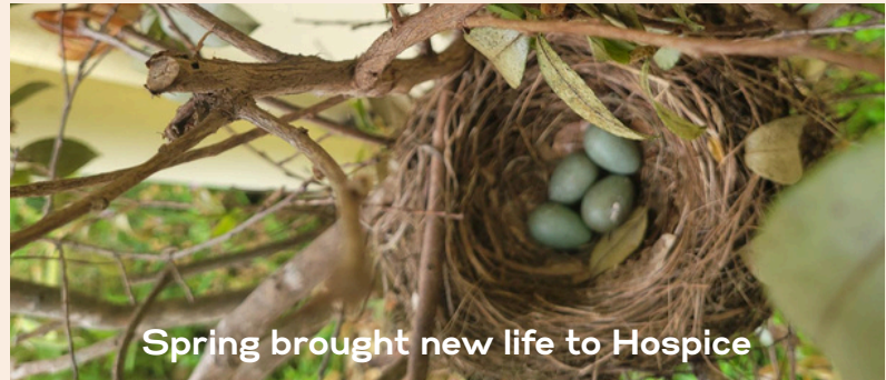
Spring brought new life to Hospice

A New Year's resolution is one that goes in one year and out the other!